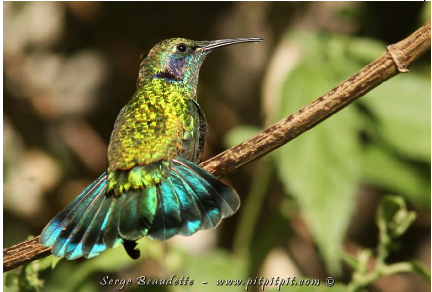
Serge Beaudette - www.pitpitpit.com ©