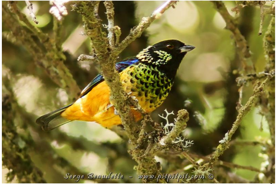
Serge Beaudette - www.pitpitpit.com ©